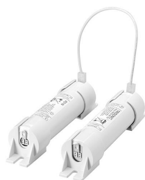
Stick + Stick; Connection: blade terminal