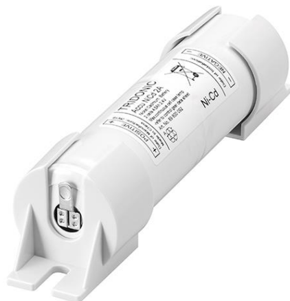
Stick; Connection: blade terminal