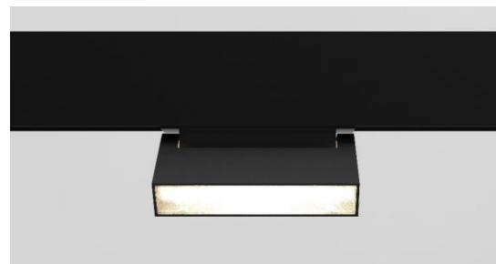
Magnetic LED light to be installed on 48 V magnetic track